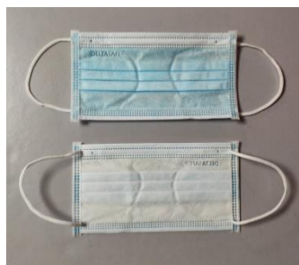
Photo of Samples

Note: Pass = Meet customer requirements; Fail = Fail customer requirements; # = No comment; N.D. = Not detected.